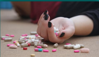
Overdose and Death