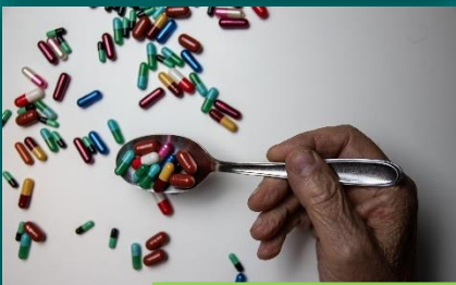
Misuse and Abuse